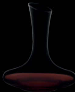
Carafe 75 A