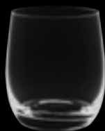
Cocktail tumbler 15 25 cl 8 ½ oz H 90 mm 3 ½ " D 79 mm 3 ¼ " No. 4233 1500