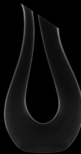
Orion H 326 mm 12 ¾" No. H 361

— Filling marks available as shown in the pricelist/on demand