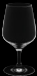
Mineral water 11

37 cl 12 ½ oz H 151 mm 6 " D 86 mm 3 ½ "