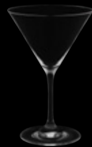
Martini 28 30 cl 10 1/4 oz H 188 mm 7 1/2" D 125 mm 4 1/2" No. 6103 2800