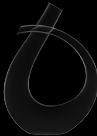
Pegasus H 340 mm 13 ½ " No. H 337