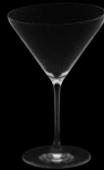
Martini 28 39 cl 13 ½ oz H 190 mm 7 ½ " D 124 mm 4 ¾ " No. 6829 R 2800