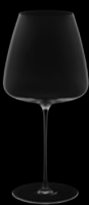
MEDEIA Wine 01 76 cl 25 ¾ oz H 240 mm 9 ½" D 110 mm 4 ¼" No. 64903 0100