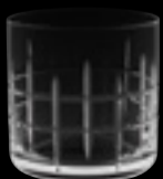
OF Montgomery 16925 37 cl 12 ½ oz H 85 mm 3 ¼" D 85 mm 3 ¼" No. 8077 H / 16925