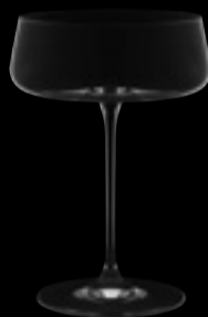
Champagne saucer 08 42,5 cl 14 1/4 oz H 170 mm 6 3/4" D 120 mm 4 3/4" No. 7048 0800