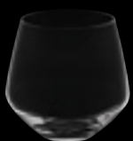
Old Fashioned 16

39 cl 13 ¼ oz H 90 mm 3 ½ " D 95 mm 3 ¾ "