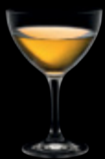
Martini / Saucer Champ 08