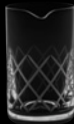
Beaker Diamond 73 60 cl 20 ¼ oz H 146 mm 5 ¾" D 87 mm 3 ¾" No. 5702 7310