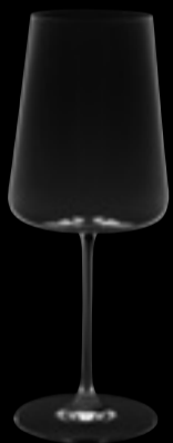
Bordeaux 00 68 cl 23 oz H 250 mm 9 3/4" D 98 mm 3 3/4" No. 7048 0000