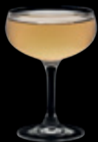
Paris Saucer Champ. 28 26 cl 8 3/4 oz H 131 mm 5 1/4" D 96 mm 3 3/4" No. 6515 2800