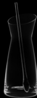
Mixer 84 cl 28 ½ oz H 241 mm 9 ½ " D 105 mm 4 ¼ " No. 5261 A

— Filling marks available as shown in the pricelist/on demand