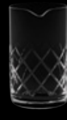
Beaker Cumberland 73 60 cl 20 1/2 oz H 146 mm 5 3/4" D 87 mm 3 3/4" No. 5702 7376