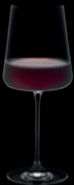
Wine 01 55 cl 18 1/2 oz H 230 mm 9" D 94 mm 3 3/4" No. 7048 0100