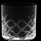
OF Knox 16076 37 cl 12 1/2 oz H 85 mm 3 1/4" D 85 mm 3 1/4" No. 8077 H / 16076

↳ Filling marks available as shown in the pricelist/on demand