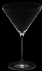
Martini 28 39 cl 13 1/2 oz H 190 mm 7 1/2" D 124 mm 4 3/4" No. 6829 R 2800