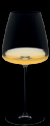
MEDEIA Wine 02 54 cl 18 ¼ oz H 225 mm 8 ¾" D 98 mm 3 ¾" No. 64903 0200