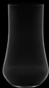
Juice tumbler 36 cl 12 ¼ oz H 130 mm 5" D 76 mm 3" No. 8411 1400