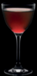
Nick & Nora 04 16 cl 5 ½ oz H 150 mm 6 " D 74 mm 3 " No. 6515 0400