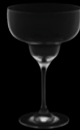
Margarita 32 34 cl 11 1/2 oz H 172 mm 6 3/4" D 111 mm 4 1/2" No. 6006 3200