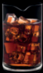
Beaker 73 60 cl 20 ¼ oz H 146 mm 5 ¾" D 87 mm 3 ¾" No. 5702 7300