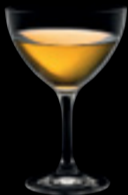
Martini / Saucer Champ 08 25 cl 8 1/2 oz H 144 mm 5 3/4" D 98 mm 4" No. 6515 0800