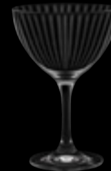
Martini / Saucer Champ. 08 OPTIC 25 cl 8 ½ oz H 144 mm 5 ¾ " D 98 mm 4 " No. 6515 P 0800