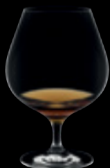
Brandy 21 66 cl 22 1/4 oz H 166 mm 6 1/2" D 112 mm 4 1/2" No. 6001 2100