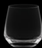
Meson 12 cl 4 oz H 63 mm 2 1/2 " D 62 mm 2 1/2 " No. 4220 0120