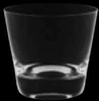
Cocktail 15 40 cl 13 ½ oz H 93 mm 3 ¾" D 104 mm 4" No. 4836 1500