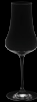
Fruit spirits glass 35 26 cl 9 oz H 210 mm 8 ¼" D 77 mm 3" No. 6751 3500