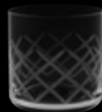
OF Diamond 16180 37 cl 12 ½ oz H 85 mm 3 ¼" D 85 mm 3 ¼" No. 8077 H / 16180