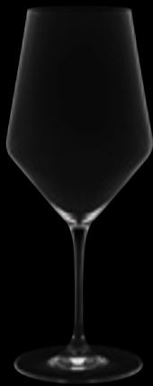
Bordeaux 00 64 cl 21 ¾ oz H 240 mm 9 ½ " D 100 mm 4 " No. 6829 0000