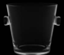
Ice bucket 91