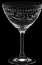
Martini / Saucer Champ. 08 DOTS 25 cl 8 ½ oz H 144 mm 5 ¾ " D 98 mm 4 " No. 6515 08925