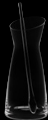
Mixer 84 cl 28 1/2 oz H 241 mm 9 1/2" D 105 mm 4 1/4" No. 5261 A