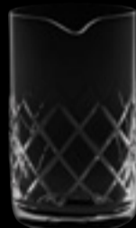
Beaker Knox 73 60 cl 20 ¼ oz H 146 mm 5 ¾" D 87 mm 3 ¾" No. 5702 7376