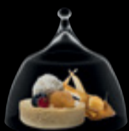
Cloche 105 H 104 mm 4 1/8 " D 110 mm 4 1/4 " No. 6719 0105