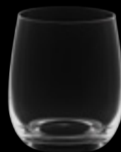
Doub. Old fashioned 166 46 cl 15 ½ oz H 103 mm 4 " D 90 mm 3 ½ " No. 4233 1660