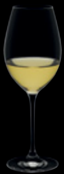
Riesling 03 36 cl 12 ¼ oz H 220 mm 8 ¾" D 79 mm 3" No. 6605 0300