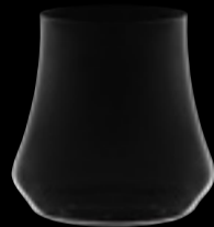
Doub. Old Fashioned 47 cl 16 oz H 98 mm 3 ¾" D 100 mm 4" No. 8411 1660