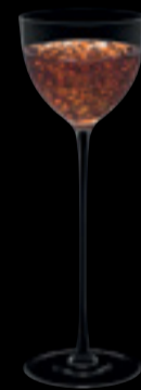
NEREA Cordial 05 13 cl 4 ½ oz H 210 mm 8 ¼" D 72 mm 2 ¾" No. 64954 0500