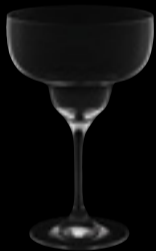
Margarita 32 34 cl 11 1/2 oz H 172 mm 6 3/4" D 111 mm 4 1/2" No. 6006 3200