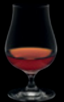
Single malt whiskey/whisky 20 cl 6 ¾ oz H 122 mm 4 ¾" D 69 mm 2 ¾" No. 6697 3200