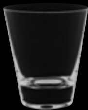
Double old fashioned 166 33 cl 11 ¼ oz H 105 mm 4 ¼" D 92 mm 3 ½" No. 4836 1660