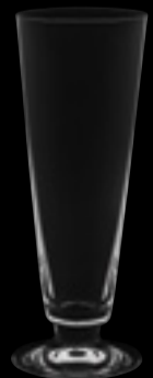
Beer tumbler 19

15 cl 5 oz H 220 mm 8 3/4 " D 66 mm 2 1/2 " No. 6339 0700