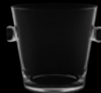
Ice bucket 91 H 130 mm 5 1/8" D 138 mm 5 3/8" No. 2823 9100