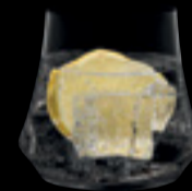
Mineral water 29 cl 9 ¾ oz H 80 mm 3 ¼" D 86 mm 3 ½" No. 8411 1300