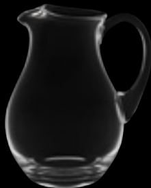
Pitcher with icelip 66

150 cl 50 ¾ oz H 215 mm 8 ½" D 147 mm 5 ¾"