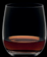
Old fashioned 16 36 cl 12 ¼ oz H 95 mm 3 ¾ " D 84 mm 3 ¼ " No. 4233 1600