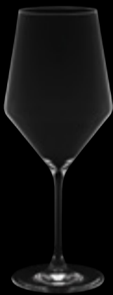
Wine 01 52 cl 17 ¾ oz H 230 mm 9 " D 93 mm 3 ¾ " No. 6829 0100