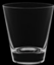
Old fashioned 16 29 cl 9 ¾ oz H 98 mm 3 ¾" D 90 mm 3 ½" No. 4836 1600