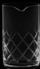
Beaker Cumberland 73 60 cl 20 ¼ oz H 146 mm 5 ¾ " D 87 mm 3 ¾ " No. 5702 7376