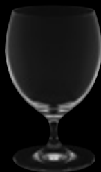
Ale beer 19

63 cl 21 ¼ oz H 162 mm 6 ¼" D 90 mm 3 ½" No. 4822 1900