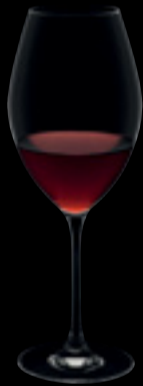
Syrah / Pinot noir 01 51 cl 17 ¼ oz H 240 mm 9 ½" D 89 mm 3 ½" No. 6605 0100