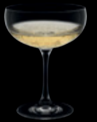
Champagne saucer 08

28 cl 9 ½ oz H 144 mm 5 ¾ " D 114 mm 4 ½ "