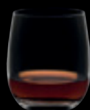
Old fashioned 16

31 cl 10 ½ oz H 150 mm 6" D 78 mm 3" No. 6050 1100