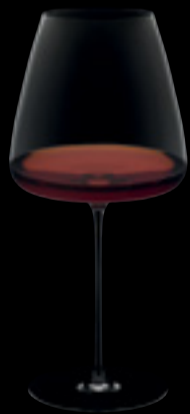
MEDEIA Bordeaux 00 89 cl 30 oz H 255 mm 10" D 115 mm 4 ½" No. 64903 0000