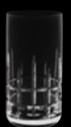
HB Montgomery 12925 39 cl 13 ¼ oz H 135 mm 5 ¼" D 70 mm 2 ¾" No. 8077 H / 12925