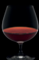
Brandy 18 40 cl 13 1/2 oz H 138 mm 5 1/2" D 95 mm 3 3/4" No. 6201 1800