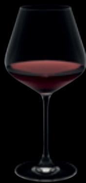
Burgundy 10 69 cl 23 ½ oz H 225 mm 8 ¾" D 114 mm 4 ½" No. 6605 1000