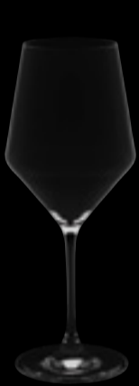
Wine 02 40,5 cl 13 ¾ oz H 215 mm 8 ½ " D 86 mm 3 ½ " No. 6829 0200