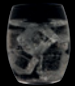
Juice tumbler 15