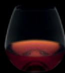
Burgundy 10 44 cl 15 oz H 95 mm 3 3/4" D 95 mm 3 3/4" No. 4245 1000