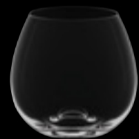
Doub. Old fashioned 166

66 cl 22 ¼ oz H 140 mm 5 ½" D 93 mm 3 ¾" No. 4245 1220