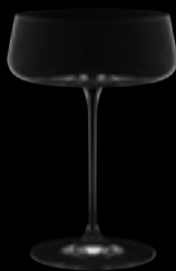
Champagne saucer 08

42,5 cl 14 ¼ oz H 170 mm 6 ¾ " D 120 mm 4 ¾ "