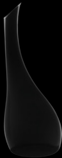
Delfinus H 370 mm 14 ½ " No. H 330