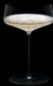
Champagne saucer 08

86 cl 29 oz H 260 mm 10 ¼ " D 100 mm 4 " No. 64900 A 0000