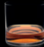
OF 16 37 cl 12 ½ oz H 85 mm 3 ¼" D 85 mm 3 ¼" No. 8077 H / 1600