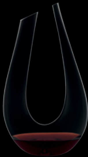
Centaurus H 400 mm 15 ¾ " No. H 336