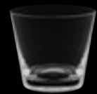
Cucina 013 13 cl 4 ½ oz H 63 mm 2 ½" D 70 mm 2 ¾" No. 4193 0130

— Filling marks available as shown in the pricelist/on demand