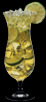
Longdrink "Hurricane" 33

36 cl 12 ¼ oz H 184 mm 7 ¼" D 79 mm 3 ¼" No. 6006 1900