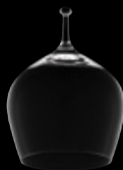
Cloche 140 H 140 mm 5 1/2 " D 116 mm 4 1/2 " No. 6558 0140