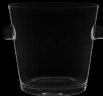
Champagne cooler 95 H 223 mm 8 ¾ " D 235 mm 9 ¼ " No. 2823 9500