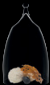
Cloche 160 H 160 mm 6 1/4 " D 91 mm 3 1/2 " No. 6719 0160