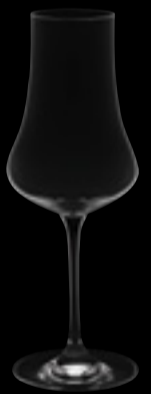
Fruit spirits glass 35 26 cl 9 oz H 210 mm 8 ¼ " D 77 mm 3 " No. 6751 3500

— Filling marks available as shown in the pricelist/on demand