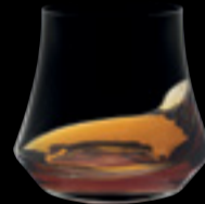
Old Fashioned 38 cl 12 ¾ oz H 88 mm 3 ½" D 94 mm 3 ¾" No. 8411 1600