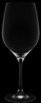
All Purpose 01 59 cl 20 oz H 245 mm 9 1/2" D 94 mm 3 3/4" No. 6119 0100