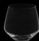
Old Fashioned 16 39 cl 13 oz H 90 mm 3 1/2" D 95 mm 3 3/4" No. 4220 1600