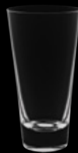
Highball 122 36 cl 12 ¼ oz H 151 mm 6" D 78 mm 3" No. 4836 1220