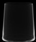
Old Fashioned 16

57 cl 19 ¼ oz H 160 mm 6 ¼ " D 78 mm 3 " No. 64955 1300