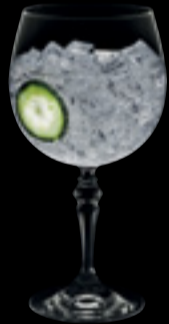
Gin Tonic 00 63 cl 21 1/4 oz H 203 mm 8" D 105 mm 4 1/4" No. 8303 0000