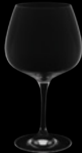
Burgundy 10 *

59 cl 20 oz H 230 mm 9" D 94 mm 3 ¾" No. 6050 0000