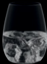
Mix Drink 122

33 cl 11 ¼ oz H 100 mm 4" D 79 mm 3" No. 4485 1500