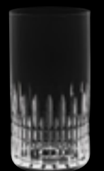
HB Kingston 12903 39 cl 13 ¼ oz H 135 mm 5 ¼" D 70 mm 2 ¾" No. 8077 H 12903

— Filling marks available as shown in the pricelist/on demand