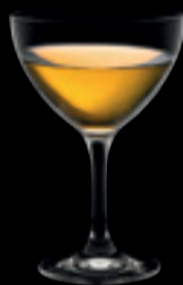
Martini / Saucer Champ. 08 25 cl 8 ½ oz H 144 mm 5 ¾ " D 98 mm 4 " No. 6515 0800