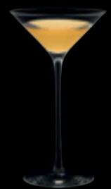
NEREA Liqueur martini 288 4 cl 1 ¼ oz H 140 mm 5 ¼" D 75 mm 3" No. 65320 A 2880

— Filling marks available as shown in the pricelist/on demand