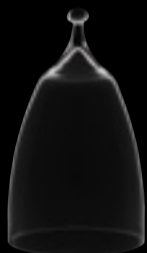
Cloche 150 H 150 mm 6 " D 83 mm 3 1/4 " No. 6719 0150