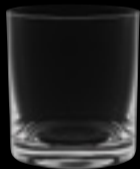
Old fashioned 16 28 cl 9 ½ oz H 88 mm 3 ½ " D 80 mm 3 ¼ " No. 4232 1600