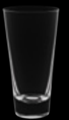
Highball 36 cl 12 1/4 oz H 151 mm 6" D 78 mm 3" No. 4836 1220