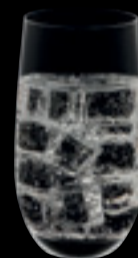
Beer tumbler 13 35 cl 11 ¾ oz H 132 mm 5 ¼ " D 73 mm 2 ¾ " No. 4233 1300