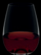
Bordeaux 00 46 cl 15 ½ oz H 112 mm 4 ½" D 87 mm 3 ½" No. 4245 0000