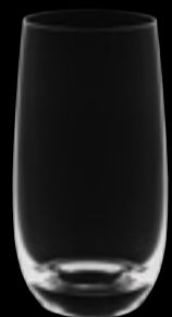
Highball 12 49 cl 16 ½ oz H 144 mm 5 ½ " D 79 mm 3 " No. 4233 1200

⇨ Filling marks available as shown in the pricelist/on demand