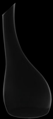
Dorado H 290 mm 11 ½ " No. H 330