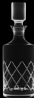
Whisky caraffe 73 75 cl 25 1/4 oz H 273 mm 10 3/4" D 100 mm 4" No. 63659 F 7376