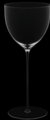
NEREA Wine 01 45 cl 15 ¼ oz H 240 mm 9 ½" D 100 mm 4" No. 64954 0100