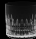
OF Kingston 16903 37 cl 12 ½ oz H 85 mm 3 ¼" D 85 mm 3 ¼" No. 8077 H 16903