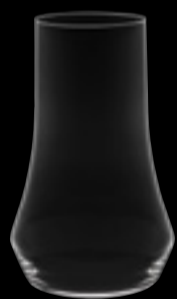
Long drink 48 cl 16 ¼ oz H 145 mm 5 ¾" D 90 mm 3 ½" No. 8411 1200