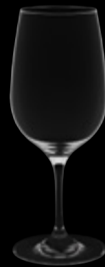
All purpose 10

55 cl 18 ½ oz H 220 mm 8 ¾" D 88 mm 3 ½"