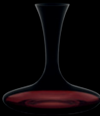
Carafe 74 100 cl 34 oz H 218 mm 8 ⅝" D 208 mm 8 ¼" No. 2819 7400