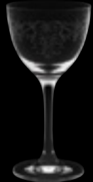
Nick & Nora 04 LACE 16 cl 5 ½ oz H 150 mm 6 " D 74 mm 3 " No. 6515 04333