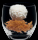
Bistro 13 cl 4 1/2 oz H 60 mm 2 1/2 " D 62 mm 2 1/2 " No. 4191 0130

While cloches were originally designed to protect seedlings from the cold and frost, they now bring the art of food presentation to a new level of sophistication and elegance. Each cloche, designed from the bowls of RONA wine glasses, boasts brilliance and clarity, while enticing diners with delectable morsels worthy of such a display. Paired with the perfect plate or tray on their own or in sets, RONA Cloches will create an unforgettable dining experience!