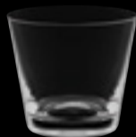
Cucina 13 cl 4 1/2 oz H 63 mm 2 1/2 " D 70 mm 2 3/4 " No. 4193 0130