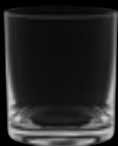
Old fashioned 16

5.5 cl 1 3/4 oz H 76 mm 3 " D 39 mm 1 1/2 " No. 4232 2000