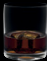
Doub. Old fashioned 166 39 cl 13 ¼ oz H 102 mm 3 ¾ " D 88 mm 3 ½ " No. 4232 1660