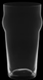
Pint glass 19

63 cl 21 ¼ oz H 162 mm 6 ¼" D 90 mm 3 ½" No. 4822 1900