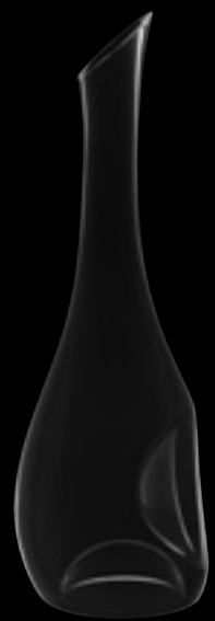
Gyrus H 410 mm 16 ¼ " No. H 353

— Filling marks available as shown in the pricelist/on demand