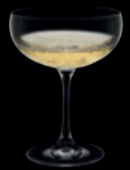
Champagne saucer 08 28 cl 9 ½ oz H 144 mm 5 ¾ " D 114 mm 4 ½ " No. 6200 0800