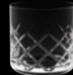
OF Knox 16076 37 cl 12 ½ oz H 85 mm 3 ¼" D 85 mm 3 ¼" No. 8077 H / 16076