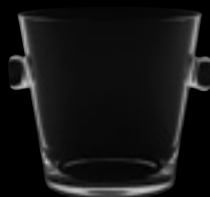
Ice bucket 91 H 130 mm 5 ½ " D 138 mm 5 ½ " No. 2823 9100