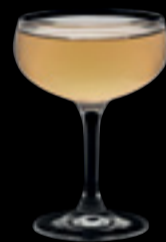
Paris Saucer Champ. 28 26 cl 8 ¾ oz H 131 mm 5 ¼ " D 96 mm 3 ¾ " No. 6515 2800