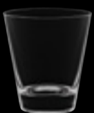
Old Fashioned 29 cl 9 3/4 oz H 98 mm 3 3/4" D 90 mm 3 1/2" No. 4836 1600