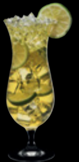
Longdrink "Hurricane" 33 46,5 cl 15 3/4 oz H 208 mm 8 1/4" D 78 mm 3" No. 6050 3300