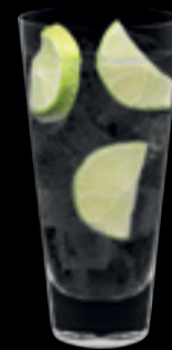
Long drink 12 39 cl 13 ¼ oz H 160 mm 6 ¼" D 80 mm 3 ¼" No. 4836 1200