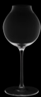
LIQUORE & COCKTAILS 25 cl 8 ½ oz H 180 mm 7" D 38 mm 1 ½" No. 65223 1010