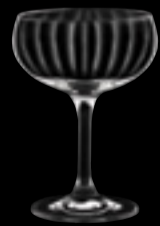
Paris Saucer Champ. 28 OPTIC 26 cl 8 ¾ oz H 131 mm 5 ¼ " D 96 mm 3 ¾ " No. 6515 P 2800

— Filling marks available as shown in the pricelist/on demand