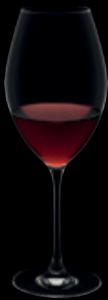
Syrah / Pinot noir 01

51 cl 17 ¼ oz H 240 mm 9 ½" D 89 mm 3 ½"