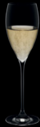
Champagne glass 09