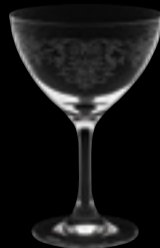
Martini / Saucer Champ. 08 LACE 25 cl 8 ½ oz H 144 mm 5 ¾ " D 98 mm 4 " No. 6515 08333