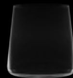
DOF 166 41 cl 13 3/4 oz H 90 mm 3 1/2" D 90 mm 3 1/2" No. 7048 1660