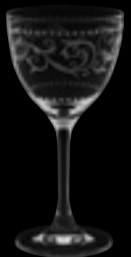
Nick & Nora 04 DOTS 16 cl 5 ½ oz H 150 mm 6 " D 74 mm 3 " No. 6515 04925

The Classic Cocktail range has been recreated using the original glass moulds that manufactured the glasses used in the 1930s Manhattan cocktail scene and made famous in venues such as Rainbow Room. These classic shapes have stood the test of time and have regained a relevance to today's growing mixology scene.