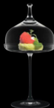
Dome 012 H 139 mm 5 1/2 " D 120 mm 4 3/4 " No. 7048 B 0012