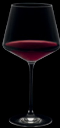
Burgundy 10 73 cl 25 oz H 230 mm 9 " D 118 mm 4 ¾ " No. 6829 1000