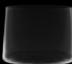
Mineral water 19

54 cl 18 ¼ oz H 100 mm 4 " D 95 mm 3 ¾ " No. 64955 1600