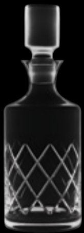
Whisky caraffe 73 75 cl 25 ¼ oz H 273 mm 10 ¾" D 100 mm 4" No. 63659 F 7376